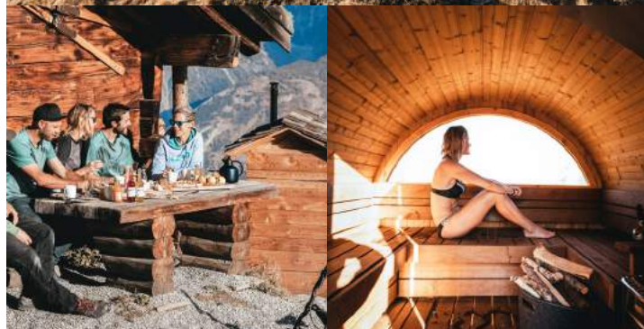
L'Alpage de Moosalp - Day 2