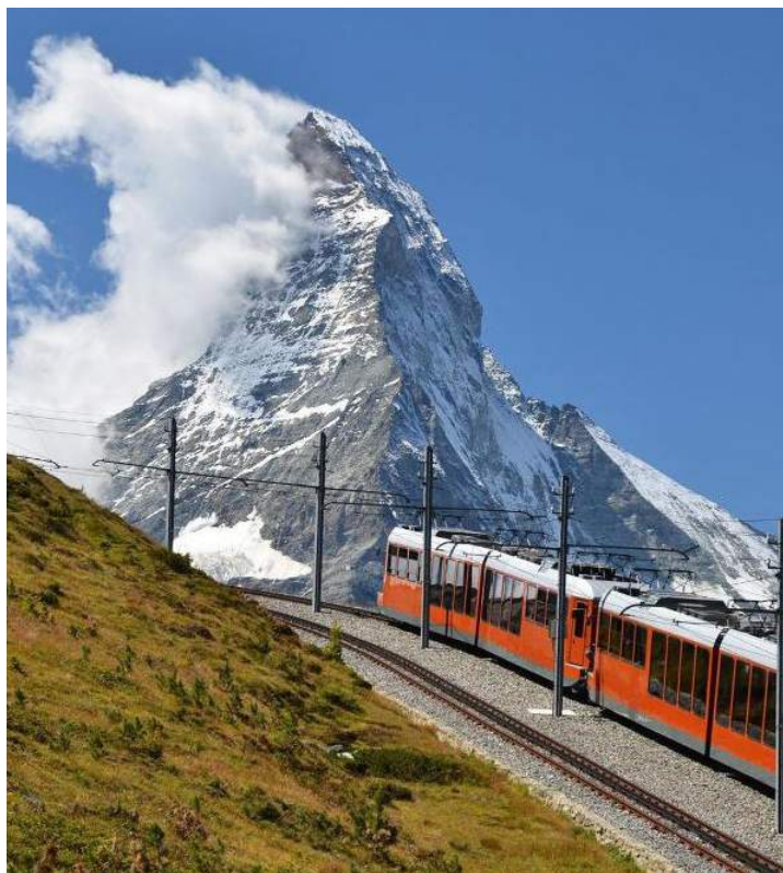
Zermatt - Day 3