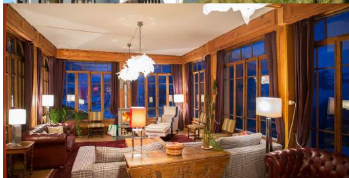
Hôtel Bella Tola - Day 1